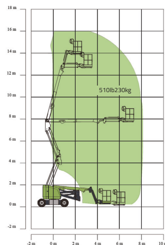
Range of Motion ZA14JE-Li